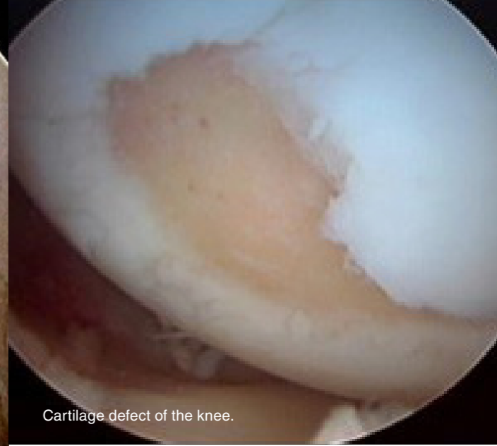
Cartilage defect of the knee.